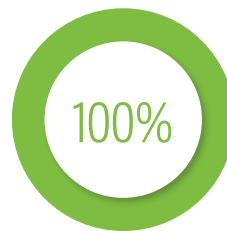
Testing accommodations fulfillment